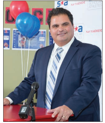
CARLO DEMARIA Mayor, City of Everett